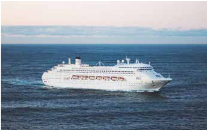
Sources of anthropogenic ocean noise include activities such as shipping and tourism.

Both active and passive acoustic methods can be used to determine leakage traces, such as bubble streams, but it is necessary to establish an acoustic baseline for comparison. Acoustic arrays are required to establish background noise across the changing seasons, including any anthropogenic contributions.