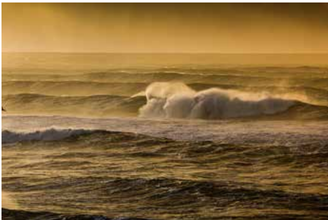
Shallow seas are highly dynamic and variable environments

Prevailing marine conditions in a given area can vary considerably over timescales ranging from tidal/daily to seasonal or decadal, but some parameters may vary fairly randomly - for example, anthropogenic noise. Conditions in deeper ocean environments are generally more stable than those in shallower seas, which are prone to more disturbance from sea surface processes such as wave action, temperature fluctuations and chemical balance.