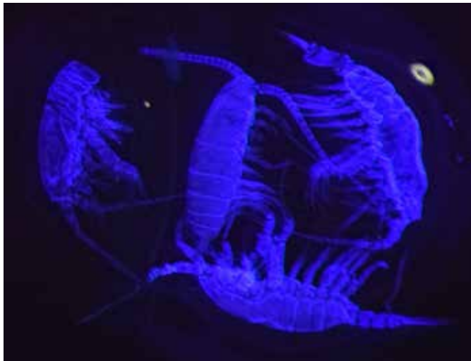
Plankton - such as these copepods - are highly sensitive to changes in seawater chemistry and would be impacted by increased ocean acidity.

The idea that some organisms can gain from increased CO 2 while others suffer negatively has led to the concept of winners and losers. Such a concept does not take into account the complexity of marine food webs or the relationships between individuals, populations and communities that are impacted