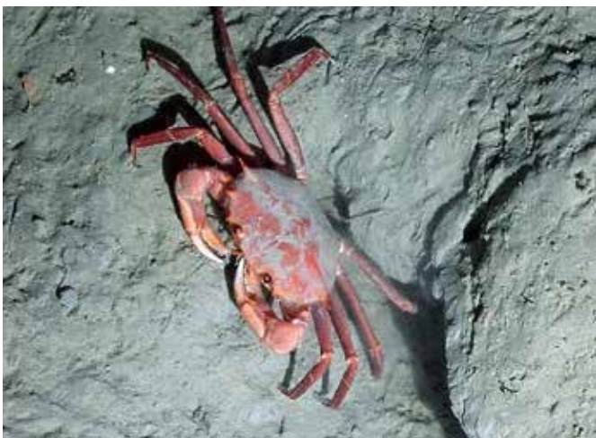
Some organisms, such as echinoderms (top), have been shown to be the most sensitive to changes in seawater acidity, whilst other animals such as crustacea (lobsters, middle image, and crabs, bottom) are more tolerant.

whenever there is an imbalance. Success of one species versus the dwindling of another alters the natural system that existed previously: the environment is changed.