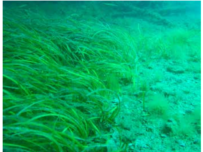
Some organisms, such as seagrasses, might reap positive effects as a result of increased ocean acidity, at least in the short term.

CO 2 is a naturally-occurring gas without which life on Earth could not survive. In high concentrations it can also be a pollutant, putting that same life at risk. Ocean acidification has been demonstrated to have positive effects on some organisms, for example seagrasses, whilst having a detrimental effect on other organisms reliant on calcium carbonate to build shells and skeletons, or those which are sensitive to seawater changes, such as many plankton and their eggs and larvae.